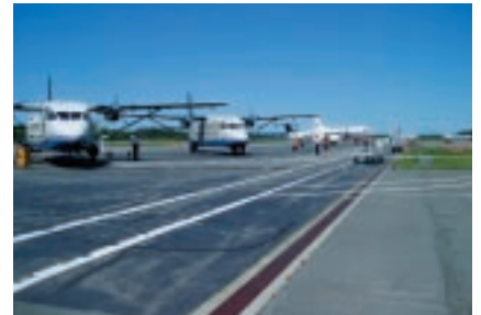
The Campbell River Airport has expanded and hosts new aerospace businesses.

International Forest Products Limited – 250-286-5000 www.interfor.com Helifor Industries Limited – 604-269-2000 www.helifor.com