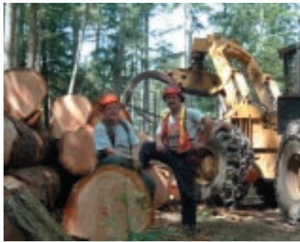
The forest industry dominates the local and regional coastal economy.

"You hear in the media that the resource sector is on the way out," Marshall says. "Well forget about it, it's a myth. Forestry is definitely not a 'sunset industry' in Campbell River, it's one of the main eco-