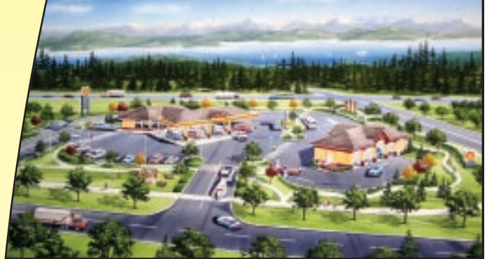
The Quinsam Crossing site is fully developed and serviced with high design and landscaping standards.

Quinsam Crossing is another successful development by the We Wai Kai Nation – owners of Quadra Island’s famous Tsa-Kwa-Luten Lodge, the We Wai Kai Campsites at Rebecca Spit and the Cape Mudge Boat Works.