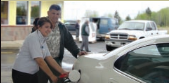
This Spring, the We Wai Kai Nation celebrated the grand opening of the Quinsam Shell Station. Its convenient and highly accessible location has made it a welcome addition to the Campbell River and North Island Communities. Pictured - We Wai Kai Nation Chief Ralph Dick pumps the first tank of gas.

This 60 acre developed and serviced site is located 5 minutes from downtown Campbell River on the Inland Island Highway – easily accessible and central to North Island travelers. It is minutes from the airport and close to the Mt. Washington Alpine Resort.