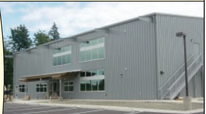
The Quinsam Community & Health Center is well underway and will serve the health and medical needs of Cape Mudge Band members and the aboriginal community at large.

If you are looking to locate a commercial or light industrial business, an RV or marine dealership, a destination restaurant or entertainment complex, this site is perfectly positioned to meet your needs.