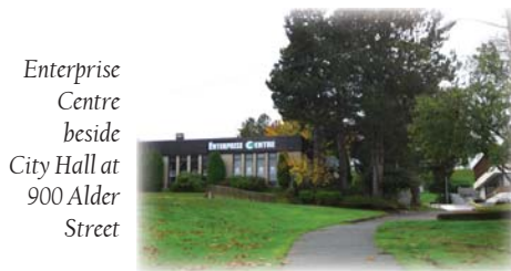
Enterprise Centre beside City Hall at 900 Alder Street