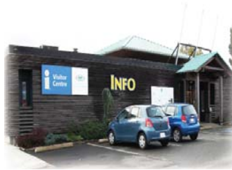
Centennial Building in the Tyee Plaza at 1235 Shoppers Row

where we are: We operate from two locations in downtown Campbell River. The Visitor Centre is at the "Centennial Building" at 1235 Shoppers Row, in the heart of the Tyee Plaza, and the Economic Development and Tourism offices are located in the "Enterprise Centre" at 900 Alder Street, beside City Hall.