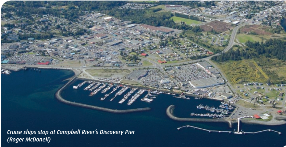
Cruise ships stop at Campbell River's Discovery Pier (Roger McDonell)