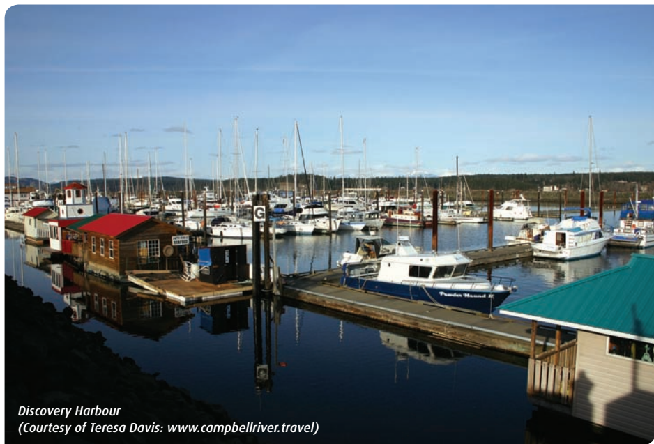
Discovery Harbour